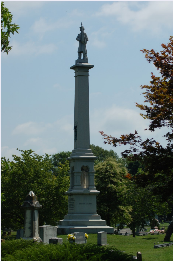
Maysville, Ky, G.A.R. monument.